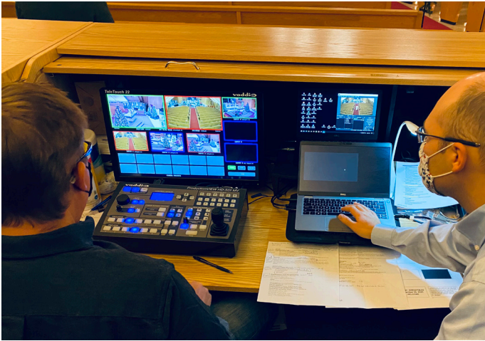
from preceding page

video cameras (including a new one in the back of the sanctuary) are working perfectly. We were able to easily hook up all of the wireless microphones to the current soundboard, allowing us many options for hearing people and instruments. We actually had a sound-